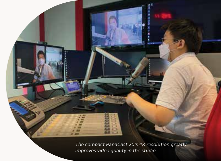
The compact PanaCast 20's 4K resolution greatly improves video quality in the studio.

BFM recently introduced its digital content arm, where teams produce videos, webinars, and other digital products, and this work needed its own specific communications infrastructure.