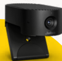
Jabra PanaCast 20