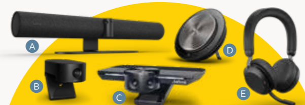
A. PanaCast 50 B. PanaCast 20 C. PanaCast D. Speak 750 E. Evolve2 75