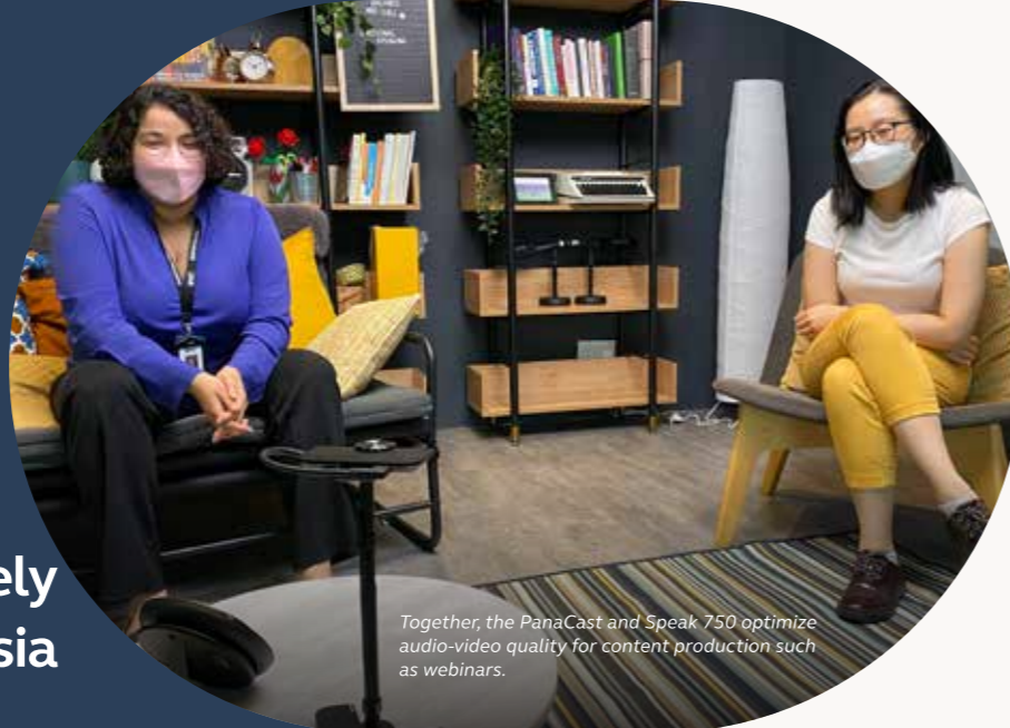
Together, the PanaCast and Speak 750 optimize audio-video quality for content production such as webinars.