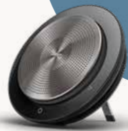
Jabra Speak 750