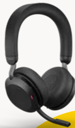
Jabra Evolve2 75

Jabra PanaCast 20 AI-powered 4K Ultra-HD personal video camera with Intelligent Zoom and Intelligent Lighting Optimization features for picture-perfect images that keep the user always in frame.